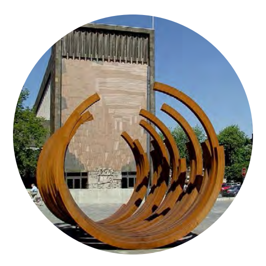
Sculpture by Bernard Venet